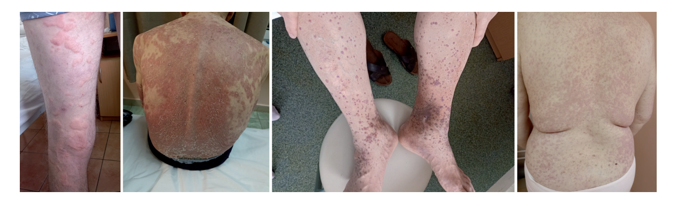
Fig. 1. Dermatological lesions in COVID-19

Bronchial asthma is a heterogeneous disease with different underlying pathologic processes. Recognizable demographic, clinical and/or pathophysiological clusters are often referred to as "asthma phenotypes" [6,7]. Over decades of asthma research, its various phenotypes and endotypes have been identified. Each of asthma phenotypes and endotypes has its own development mechanisms. In our view, basic classification of asthma was made by A.D. Ado and P.K. Bulatov (1969), supplemented by G.B. Fedoseev (1982) [8]. That asthma classification distinguished 10 clinical and pathogenetic variants: atopic, infectious-dependent, autoimmune, steroiddependent, dysovarian, severe adrenergic imbalance, cholinergic, neuropsychic, aspirin-induced, physical exertion asthma. GINA (2023) identifies other major